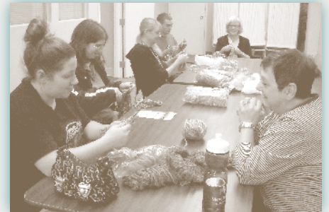
Monday evening clinic clients pass the time by learning how to knit.

NEEDED: #13 KNITTING NEEDLES If you can donate sets of #13 knitting needles, we can use them! Please contact JoAnn Henderson at 216-662-5700.